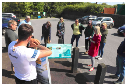
Representatives from Mayo County Council, Geological Survey Ireland, Fáilte Ireland, & University of Notre Dame meeting local businesses in Clonbur

Familiarisation visits for communities, businesses, and funders