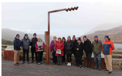
Geopark Liaison Reps, mostly from SW Mayo, on the FAM tour of north Connemara communities