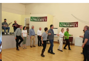
UNESCO assessors having a go at the Siege of Ennis during the communities' event at Crossroads