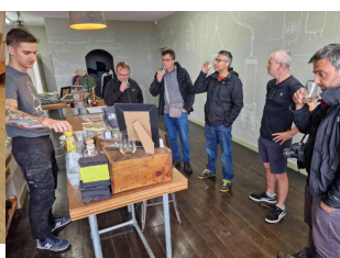
Sampling the goods to complete a tour of Lough Mask Distillery, Tourmakeady, Co Mayo