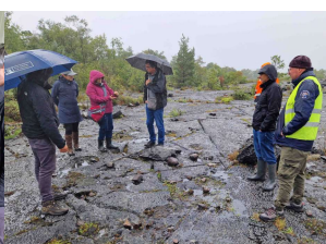
Discussing the geological heritage of the limestone pavement, Clonbur Woods