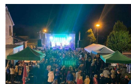
A glimpse of the atmosphere at Ballinrobe Festival 2023