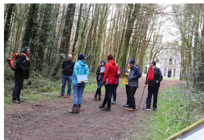
Liaison Reps from communities in north Connemara visiting Moore Hall and Lough Carra