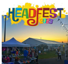
Ready for the night at Headfest 2023 as the sun goes down