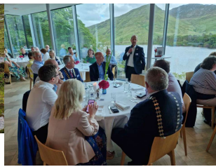
Some of the guests at Lunch event Kylemore Abbey-Notre Dame campus (also below)