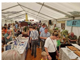
Inside the grand marquee at the Cong Food Village Festival in July