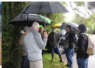
Representatives of Lough Carra LIFE project and the Catchment Association at Moore Hall