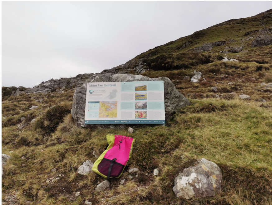
One of the panels on the Mám Éan trail

Fáilte Ireland is our national tourism agency and one of the JCWL Geopark partners. Through their guidance, and in particular close collaboration with the Wild Atlantic Way team in Galway and Mayo, the Geopark will increasingly develop as an emerging tourism destination for the region. A key resource is the registration of the Geopark on the Discover Ireland listing. This is the platform used to showcase to the world and is available in multiple languages. Additionally, all of the professional photography commissioned for the Geopark's website has been added to the Tourism Ireland content pool for anyone to use on travelogues or promotional articles. This improves the visibility of all the businesses in our current listing and is a focal point for all our partners to refer to.