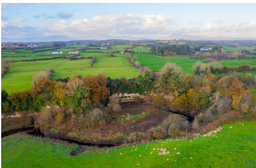
One of the many JCWL Geopark images now available on Discover Ireland

An EU-funded Erasmus+ project, which JCWL Geopark is a partner, kicked off in Norway's Geopark Sunnhordland in October 2023. The education-focussed project aims to improve the teaching and learning capacity within the partner organisations and the users of geoparks. The five partners include two teacher training universities in Norway (one in lead), and four geoparks – one each from Norway, Italy, Romania and JCWL Geopark. Continuing for 36 months, the project will develop digital resources at a number of geosites in the 4 geoparks and general guidelines for excursions. In a nutshell, it aims to stimulate innovative learning by combining the expertise of the geoparks with experienced teaching.