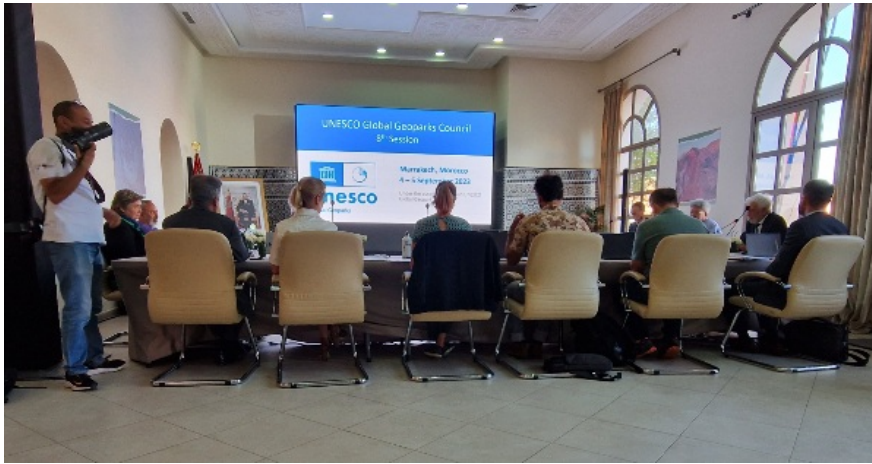
UNESCO Global Geoparks Council in session in Morocco