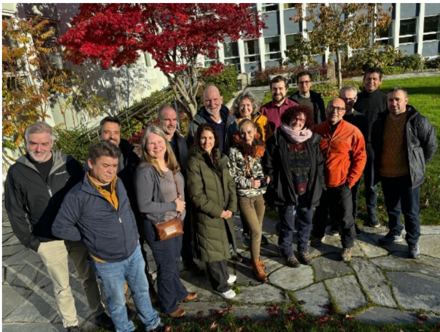
Full project team in Geopark Sunnhordland