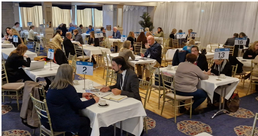
Mayo Tourism Networking event

Geoparks need to get the word out about their existence. There's no point being a best kept secret. Joyce Country and Western Lakes Geopark is no exception. Keen media watchers/listeners among you will have noticed an increase in media coverage of the Geopark in recent months. Local newspapers publishing JCWL Geopark stories include Connacht Tribune, Tuam Herald, Connaught Telegraph, Mayo News, Western People, Mayo and Galway Advertisers. Broadcasters include Midwest Radio, Galway Bay FM, Connemara FM, Radio na Gaeltachta and TG4. We appreciate all the coverage. For those of you in the digital world, keep an ear and eye out on facebook, twitter/X and Instagram, including various influencers out there @JCWLGeopark.