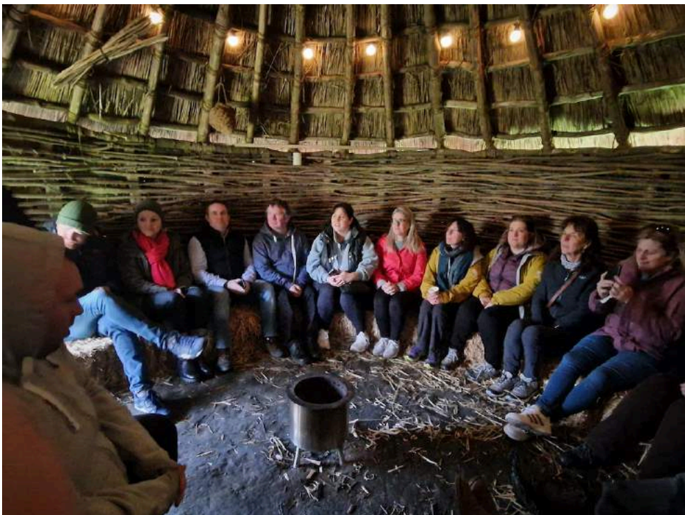
Business network visiting Bluebell Lane's fireside yurt for night-time cultural experience, Co Down