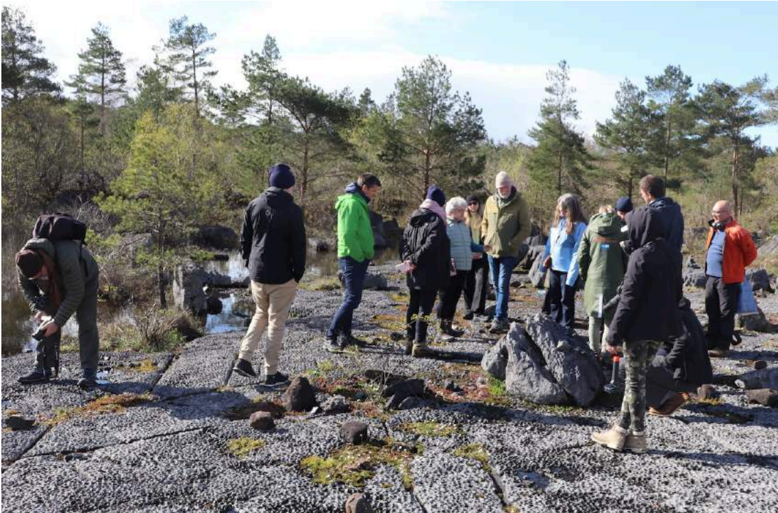
Erasmus+ partners at limestone pavement in Clonbur Woods, during their April visit to Ireland