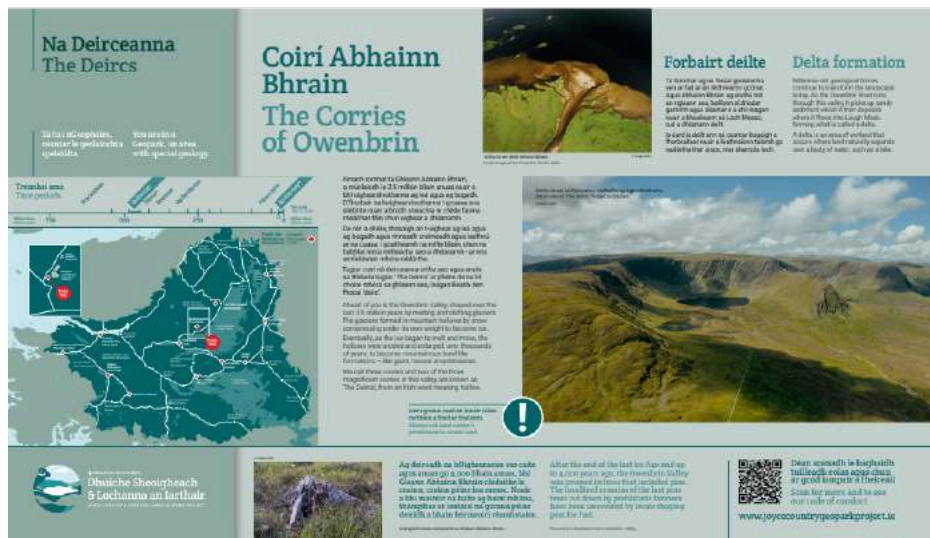
Draft images of information panels for two Geopark geosites at Corr na Móna and Tourmakeady