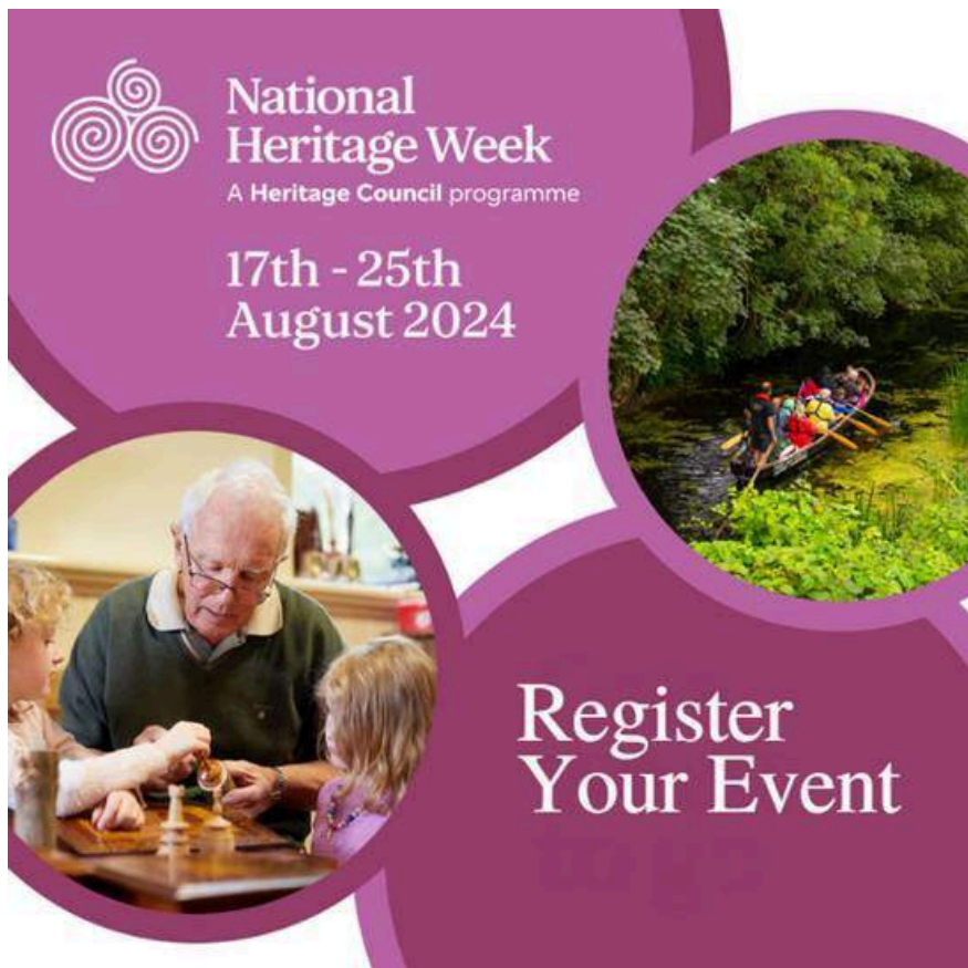
National Heritage Week 2024 poster