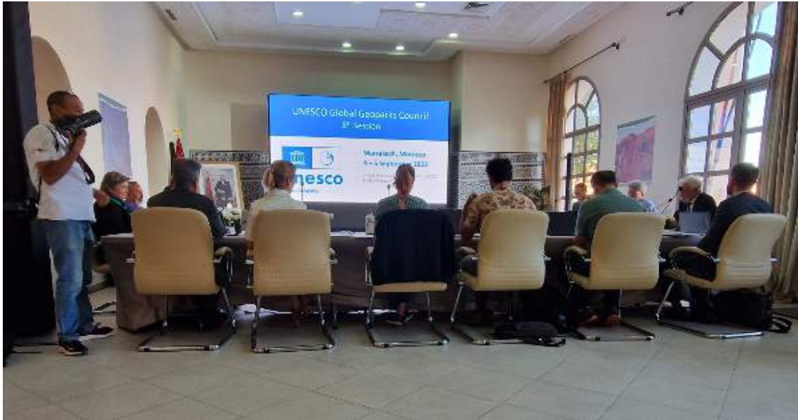
UNESCO Global Geoparks Council meeting in Morocco, September 2023