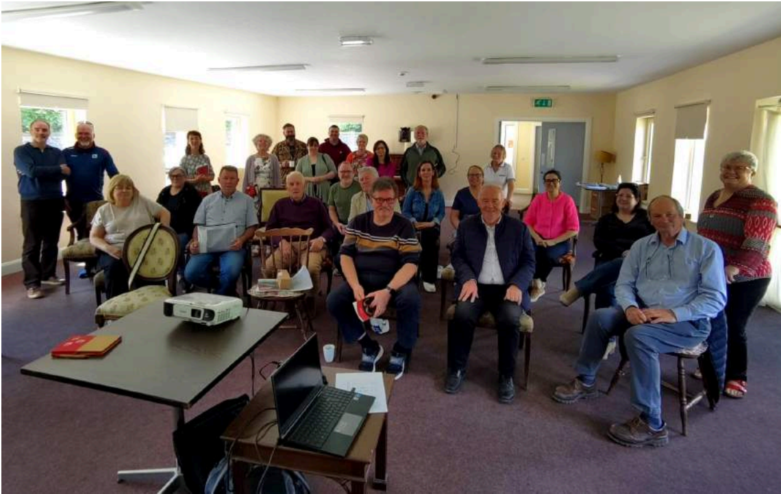
Participants at the Geopark Communities Forum 23 June 2024, Cong Crossroads Centre