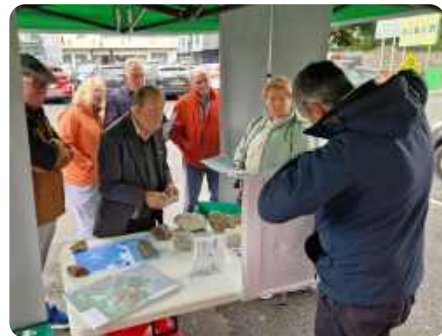
Geopark roadshow in Oughterard Courthouse and at Ballinrobe post office