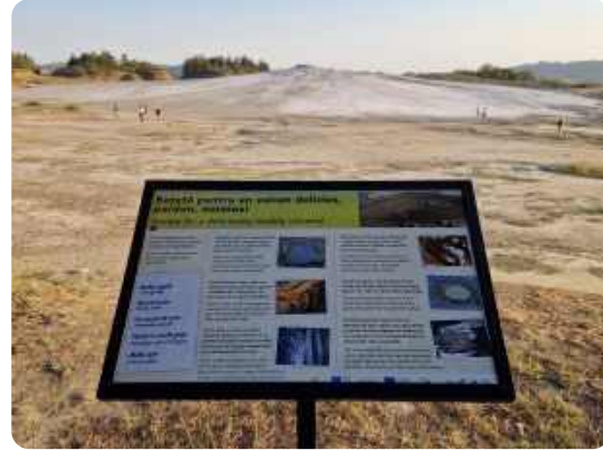
Erasmus+ work meeting in Romania