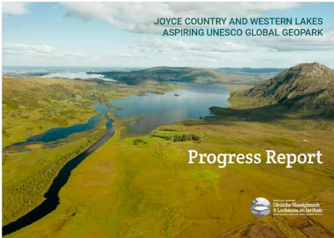
Cover page for progress report to Irish UNESCO Global Geopark Committee