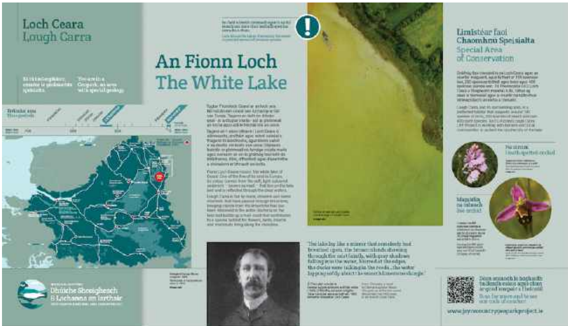
Approved information panel for Lough Carra