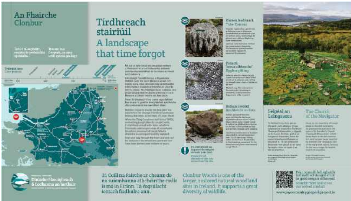
Approved information panel for An Fhairche/Clonbur