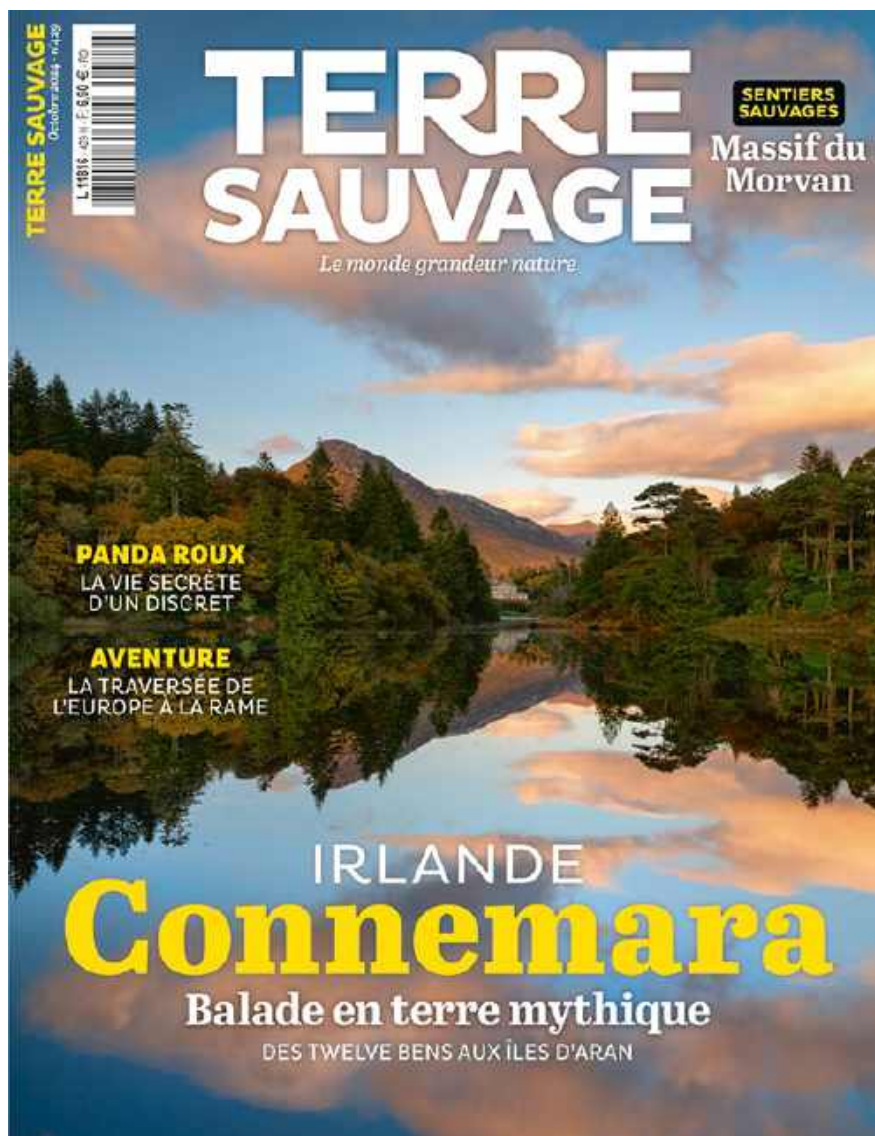
Cover of Terre Sauvage magazine October 2024 issue

In part to mark International Geodiversity Day (6 th October) and in part to celebrate geoh heritage in the community, Geological Survey Ireland's Geoh heritage Programme hosted an event at the Department of the Environment, Climate and Communications offices at Beggars Bush, Dublin, on 7 October to celebrate Irish geoh heritage. The day showcased projects from around the country that were funded by GSI's annual geoh heritage grants in recent years. Project representatives gave short, informal updates on products, interpretative boards, and other work they've done to make geology and geoh heritage accessible to the public. JCWL Geopark, the three existing UNESCO Global Geoparks in Ireland, and other groups and organisations who have received funding gave short updates on products, interpretative boards, and other work they've done to make geology and geoh heritage accessible to the public. Each project also had a stand area to display their work. There was lively networking, sharing of ideas, enthusiasm, and many examples of geoh heritage in the community supporting the UN Sustainable Development Goals' (SDGs).