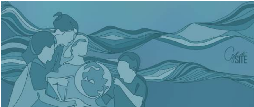
Erasmus + GeoSite project logo

JCWL Geopark has been awarded a Gradaim Gnó (business award) by Glór na nGael recognising the efforts undertaken in the promotion of the Irish language. This national scheme allows businesses and organisations to be assessed and officially recognised for their use of the Irish language. For 2024, the Geopark was given a gold medal for its signage, a silver medal for marketing and branding and a bronze medal for service in Irish. These are good benchmarks on which the geopark will improve on in its future development. Beyond the full bilingual aspect of all its publications, JCWL Geopark also encourages increased use of the Irish language through its business network (one of the seven principles of the Geopark Charter for Communities and Tourism) and its education programme (see above). A plaque for the award was presented at a ceremony in Croke Park in Dublin on 12th November along with over 100 other businesses from around Ireland. The Geopark encourages any of its business partners to get in contact with Glór na nGael and register for the scheme to also be recognised for their promotion of the Irish language in future.