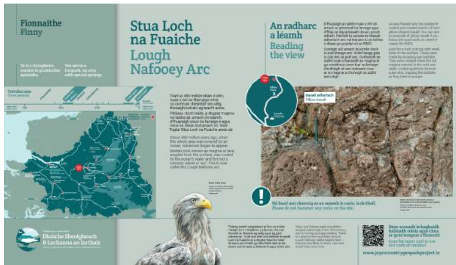
Approved information panel for Fionnaithe/Finny