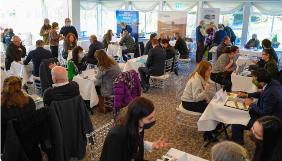
Previous Business Networking event at the Lodge at Ashford