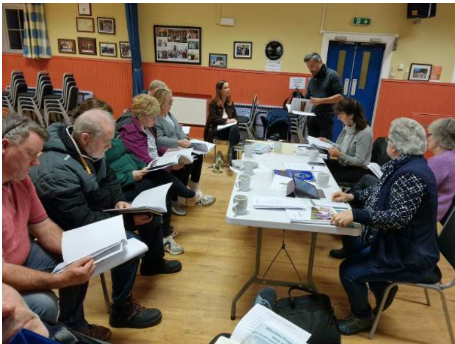
JCWL GeoEnterprise AGM held in Partry community hall