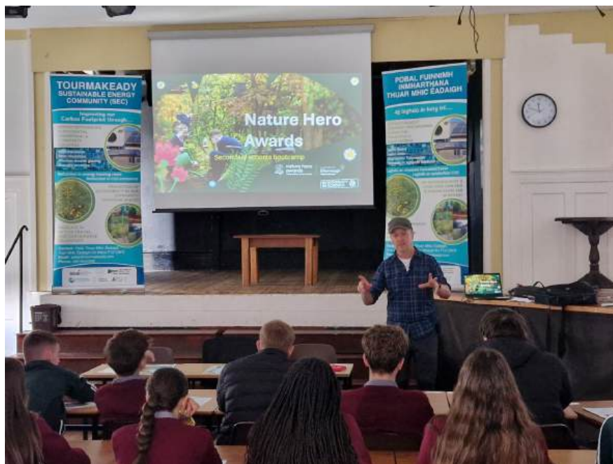
Biodiversity in Schools workshop at Coláiste Muire, Tuar Mhic Éadaigh