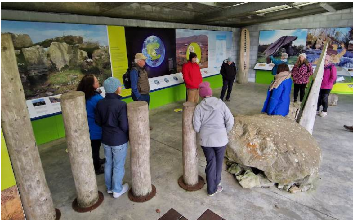
Cavan Burren Interpretive Centre in Cuilcagh Lakelands UGG