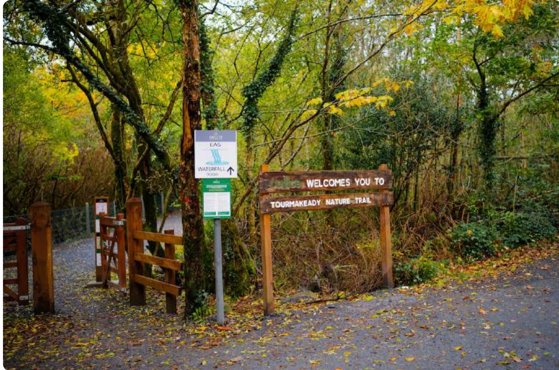
Entrance to Tourmeakeady Woods