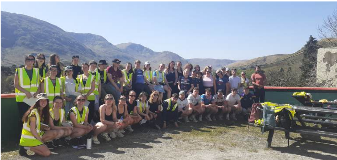
University of Galway students at the Larches

January's Storm Éowyn was very severe on people, buildings, trees and forests, but it hasn't prevented work identifying boulders to fit in a geodiversity trail in Tourmakeady Woods. This walk, funded by Geological Survey Ireland, is a partnership with Coillte and the local Coiste Pobail Thuar Mhic Éadaigh. It is implemented by the Geopark in association with Comharchumann Dhúiche Sheoigheach Teo. Quarries and some other landowners in the Geopark region are generously providing boulders of particular rock types for the trail. The walk will consist of 10 to 12 boulders of distinct rock types set at intervals along the 500m walk from the Woods carpark to Tourmakeady Waterfall with a small information panel beside each. There will also be additional panels identifying various native species present in this People's Millenium Forest. The development will strengthen the link Tourmakeady, and other communities, have with the wider Geopark and develop the woods further for education and enjoyment.