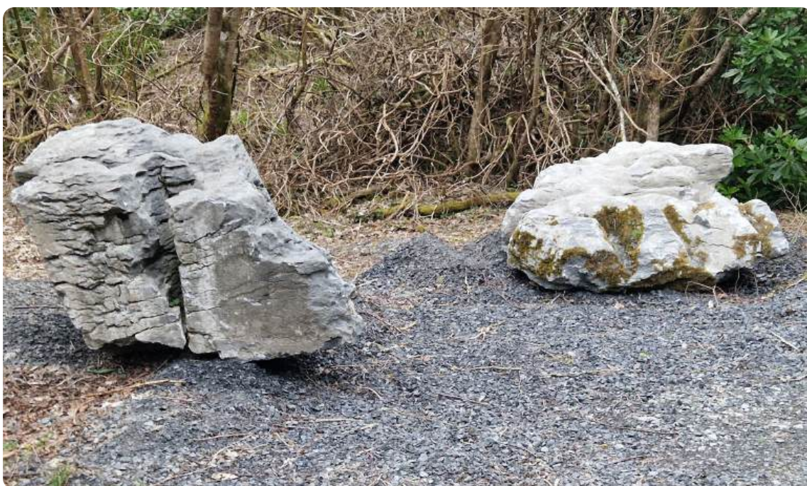
Two of the chosen boulders for the geodiversity trail

The Erasmus+ project partners meet next at the Tuscan Mining UNESCO Global Geopark in Italy at the end of April. The project partners are developing early versions of digital resources and of the website that will host them including virtual fieldtrips. The 3-year project, led by the University of Western Norway, is a partnership with the University of Stavanger (Norway) and four European geoparks: JCWL Geopark, Sunnhordland UNESCO Global Geopark (UGG) in Norway, Tuscan Mining UGG in Italy, and Buzău Land UGG in Romania. The project outcomes will add significantly to the engagement and learning tools for geoparks and will be tested in local schools from next September.