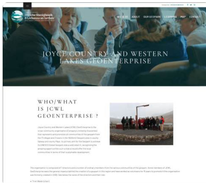
Draft webpage of information on JCWL GeoEnterprise