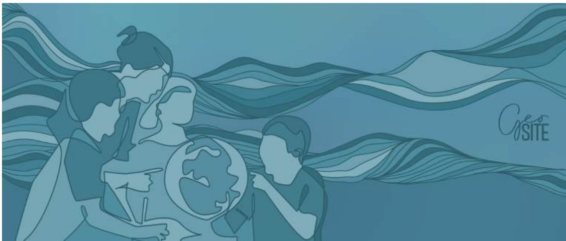
Erasmus+ GeoSite project logo