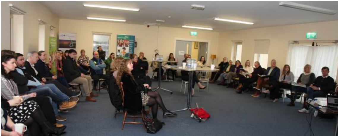
Business network event at the Crossroads community centre

State agencies play a key role in Geopark governance, funding and support for achieving and retaining UNESCO Global Geopark status. Their representatives on the Funders Group, Coiste Treorach Group (advisory) and Operations Management Group are kept up to date regularly. We also engage with County Councillors in Galway and Mayo through presentations at Municipal District (MD) levels, notably those with communities in the Geopark. Already this year we have presented at MD meetings in Connemara, Tuam and Claremorris-Swinford, receiving strong endorsement from each. Plans for further presentations soon include Castlebar MD and Westport-Belmullet MD, and to the overall council meetings.