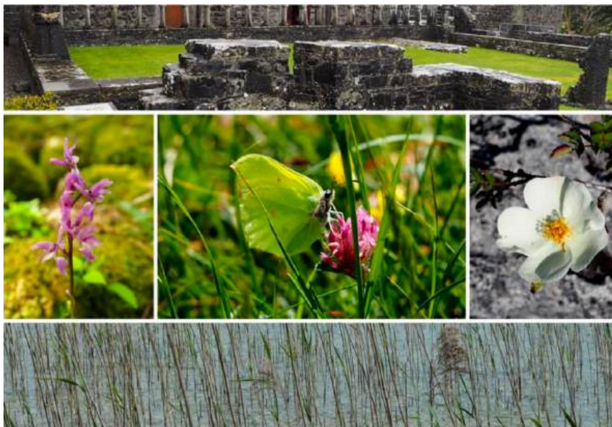
Ballintubber Biodiversity Action Plan 2021-2026